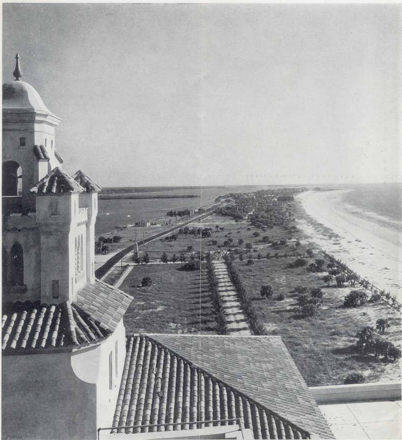
A view of Pass-a-Grille Beach from the roof of the Don Ce-Sar, showing the southern tip of the island lying between Gulf and Bay.